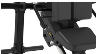
Wear Resistant Roller