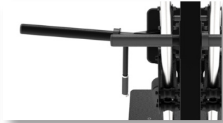
High strength plastic barbell tube cover